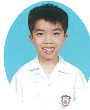
Elf 1 LEUNG TO YEUNG (3D)