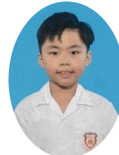
Elf 2 YU WAI HIN (3D)