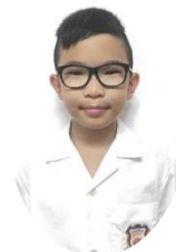
Elf 2 LI SZE LONG (3R)