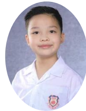
Frosty NIP TSZ LONG (3L)